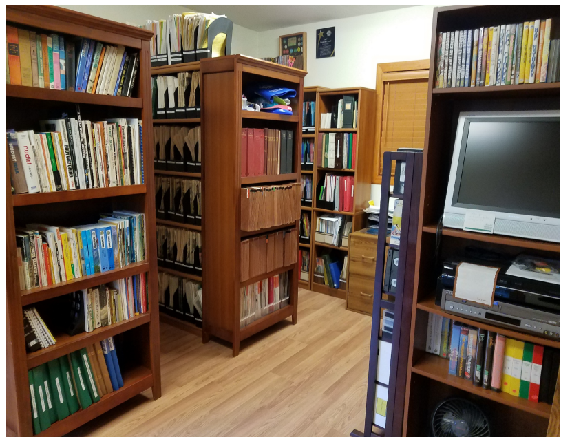
Regional Library - Main building

AANR-NW Historians historian@aanr-nw.org